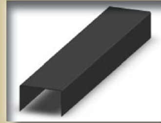
Series 1560 (SS051)