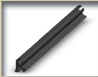
Series 1610 (SS821)