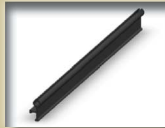
Series 1560 - 90/180 (SS809)