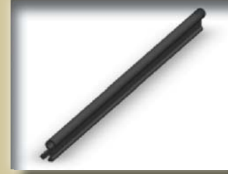
Series 1560 - 45/90 (SS804)

FOR MORE DETAILS ON THE SUPERLOC™ SHEET PILE SYSTEM AND SUPERWALE™